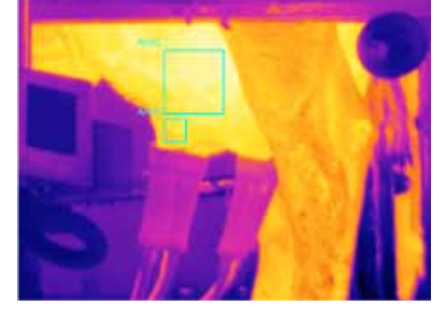
Automatic analysis software uses advanced algorithms to detect developing Mastitis in thermal images of cow udders.

Estimates vary, but it is certain that the total annual cost of Mastitis in dairy cows for European farmers runs in tens of millions. "I was shocked to find that the average dairy farmer is currently losing 20,000 to 60,000 Euros each year due to Mastitis. That is a large sum of money. We therefore set out to find a solution for this problem: an automatic early detection system based on thermal imaging technology."